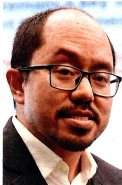
Qaiser: Housing unaffordability remains a major hurdle for people intending to own a house.